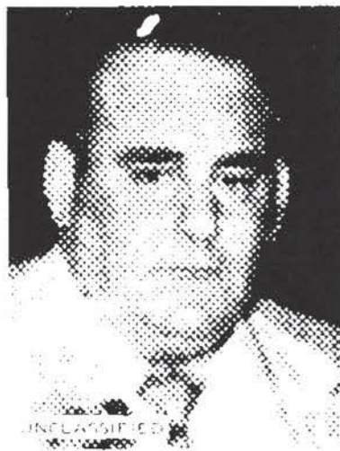
PARAGUAY'S PASTOR CORONEL